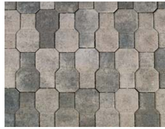
Pewter Blend, Running Bond Pattern