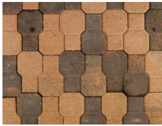
Cumberland Blend, Running Bond Pattern