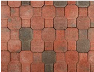
Red River Blend, Running Bond Pattern