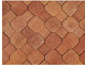
Warioto Blend, Herringbone Pattern